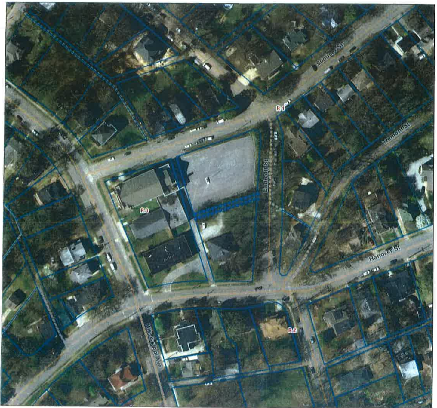
MR 2014-087 Abandonment of an Unopened Alley in the 1000 blk of Endicott St