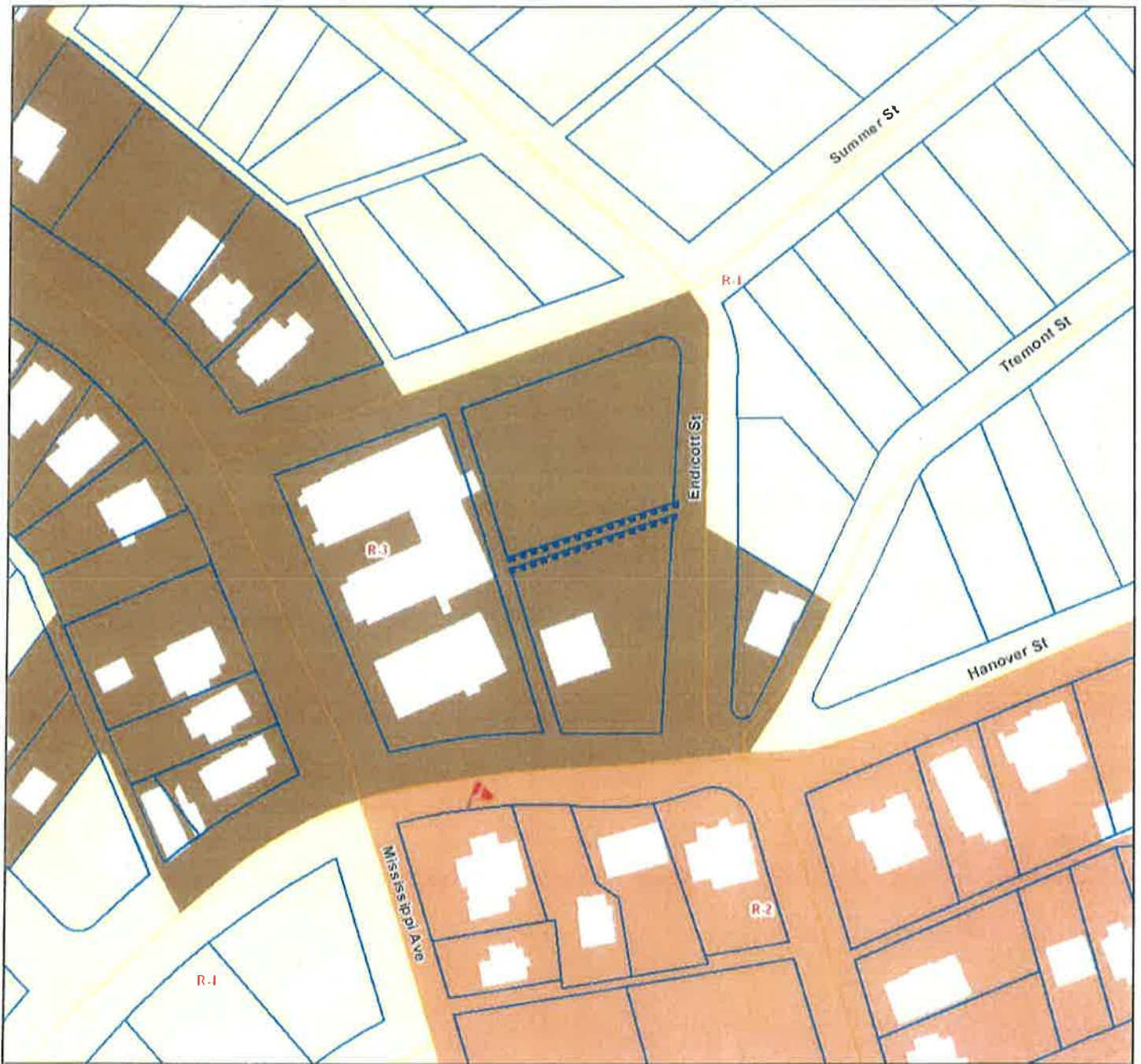
MR 2014-087 Abandonment of an Unopened Alley in the 1000 blk of Endicott St