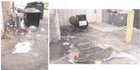
Stormwater impact from recycle bin spill