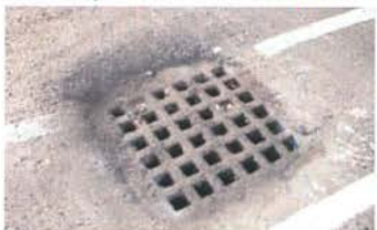
Grease evidence at storm grate. Grease was discharged into stream. Enforcement action was taken.